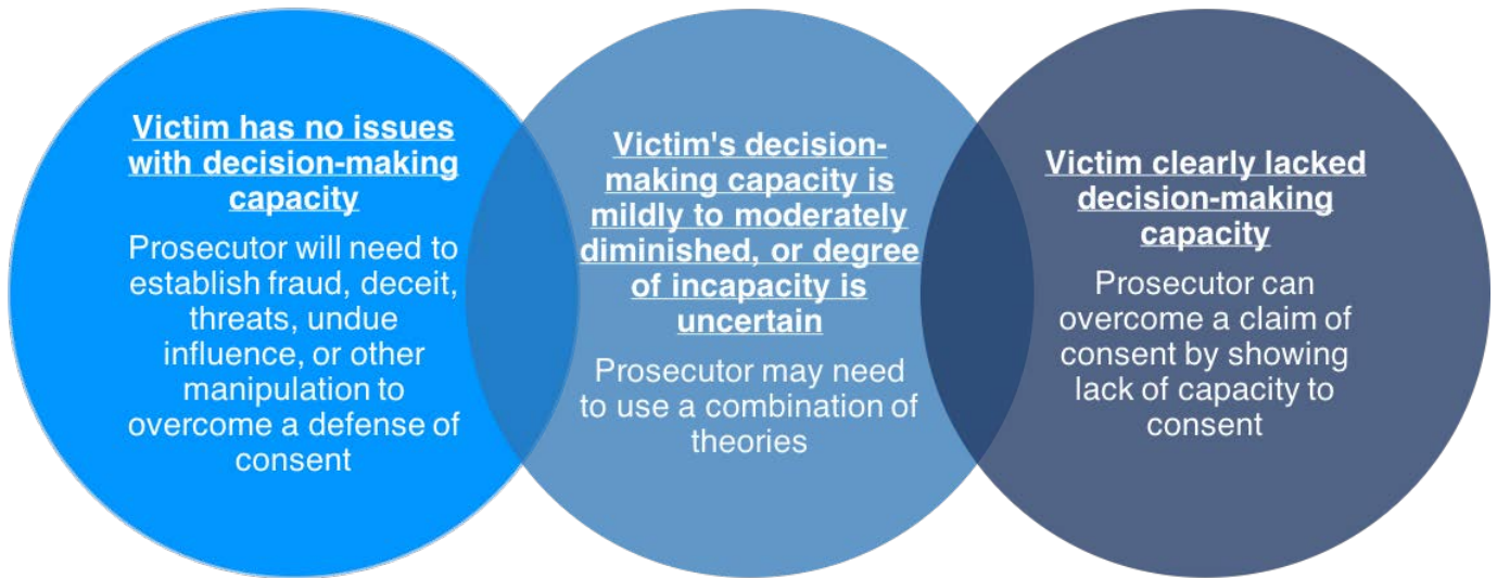
Figure 1. Prosecutorial Evaluation of Victim's Decision-Making Capacity